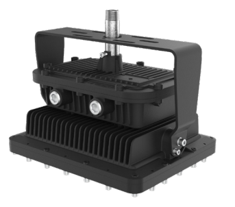
Pendant* *Conduit and yoke shown for illustration purposes only