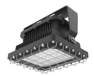
Ceiling (shown with wire guard) (#WG01 ordered separately)